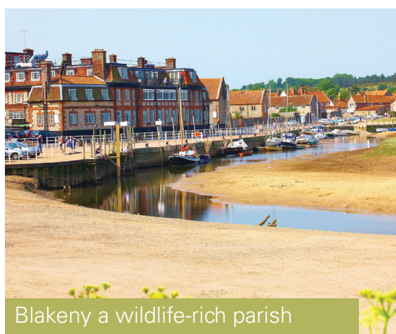
Blakeney a wildlife-rich parish