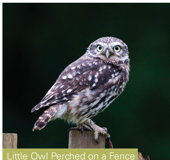
Little Owl Perched on a Fence