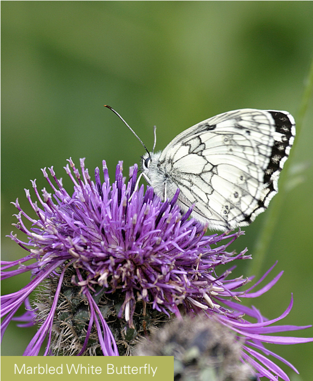
Marbled White Butterfly