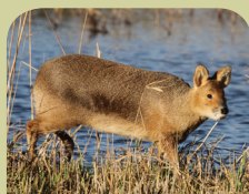
Chinese water deer