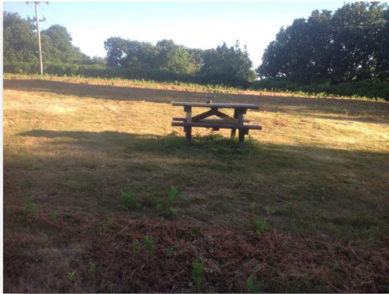
Picnic bench area