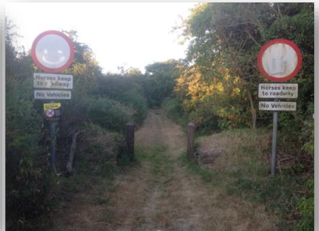
Path around site